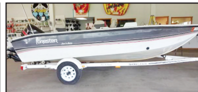
1991 Forester V165