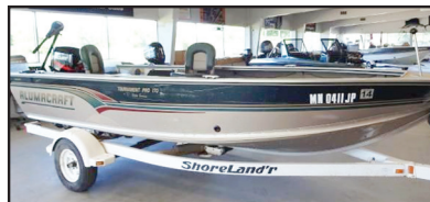
2000 Alumacraft 170 Pro Tournament Elite Series

We have a diverse line of products and services